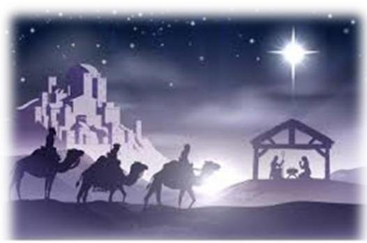
chattenteck own - 15855X881

<sup>44</sup>And he preached in the synagogues of Galilee.